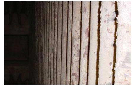
Above: Superheater tubes before and after cleaning with KRR Mobile PWT. Below: Examples of both fixed and mobile PWT equipment.